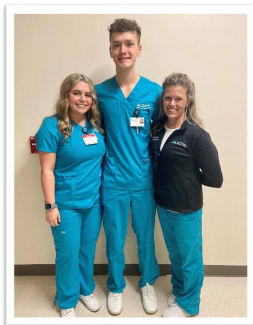
Photo Identification Badge - A Conemaugh Memorial Medical Center photo identification badge is to be worn at all times. The ID badge is to be worn on the upper chest with photo and information visible. The badge is to be unadorned.

Uniform – The complete school uniform consists of the white or teal top with school logo, teal slacks, photo ID badge, white leather shoes, and white socks. Any uniform that appears discolored, stained, soiled, or torn must be replaced. Since areas requiring scrub clothing as clinical dress tend to be cool, a clean white long sleeve shirt without a logo may be worn (no thermal underwear) under the uniform scrub top.